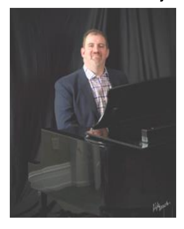
SUNDAY, APRIL 19, 2020 3:00pm St. Paul's Lutheran Church York, PA