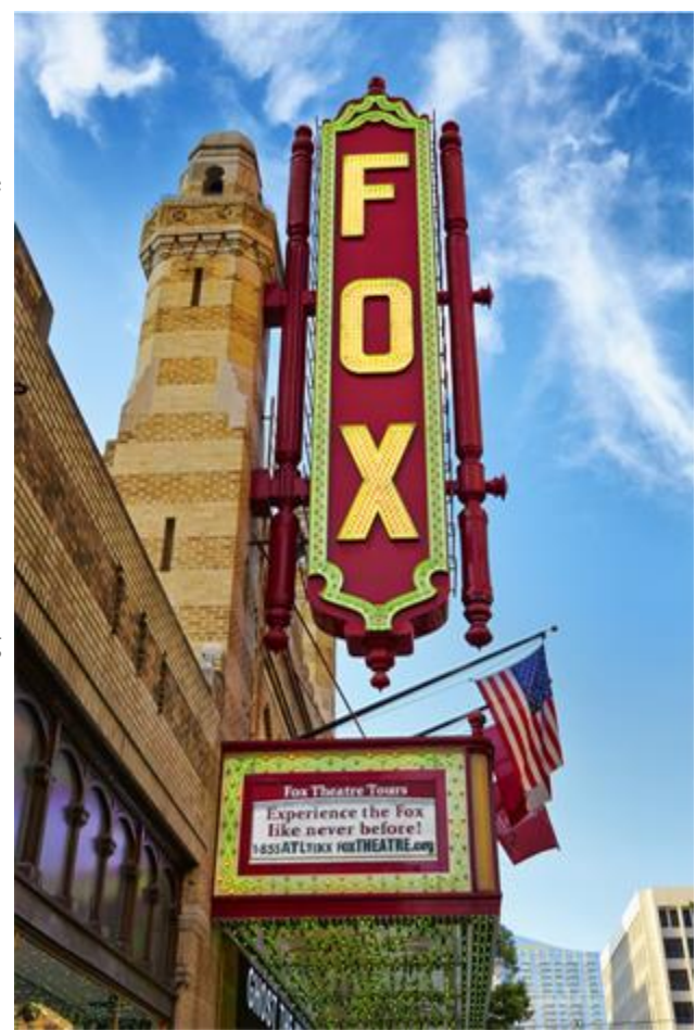
The Fox Theater in Atlanta

There was just one problem: creating the elaborate and ornate design proved to be more financially burdensome than the Shriners had expected. After all, the design incorporated things like gold leaf and trompe l'oeil art, and all of that comes at a big price. To solve their financial woes caused by their grand designs, the Shriners leased the auditorium they'd conceived of to a movie mogul named William Fox.